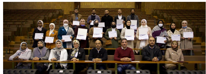
University of Benghazi celebrating the graduates of the program

Under a Stevens grant received and implemented jointly with New York SUNY Upstate, NCUSLR initiated a virtual Educational Program covering the topic of COVID management. Students and faculty from Benghazi and Tripoli Medical schools joined colleagues from SUNY Upstate in 2 courses held from November 2021 to March 2022.