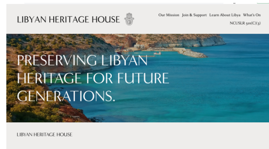
A screenshot of Libyan Heritage House homepage

NCUSLR is proud to have sponsored the creation of the " Libyan Heritage House ", a website which details Libya's rich history, peoples, cultures, and geography. It is written and assembled to become a practical but rich introduction for visitors, students or career professionals who want a quick and efficient exposure into Libya. Viewers are quickly captivated by the wealth of this country, its vast resources, its beauty, and fascinating history and archeological sites, as well as the rich diversity of its peoples. I invite all to enjoy a virtual tour of its amazing pages and images by clicking here .