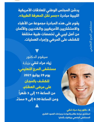
A poster of a visitor doctor to Almarj sponsored by NCUSLR